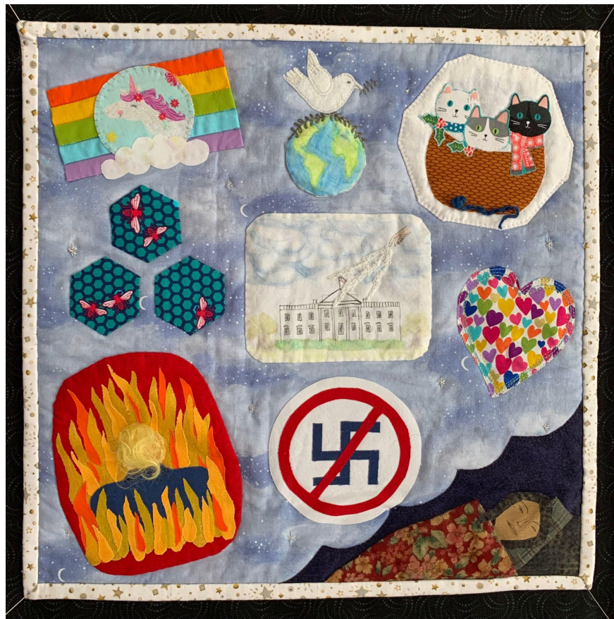
“Dream Big, Dream On” By Lesley Fagan