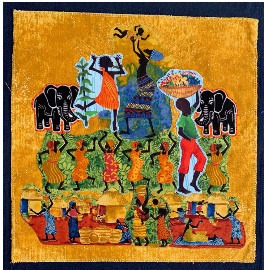
"It Takes A Village" By Polly Matsuoka