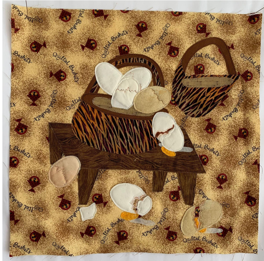
"Don't Put All Your Eggs In One Basket" By Pat Masterson