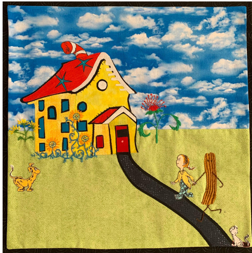
“Bring Home The Bacon” By Wednesday Craft Day Ladies